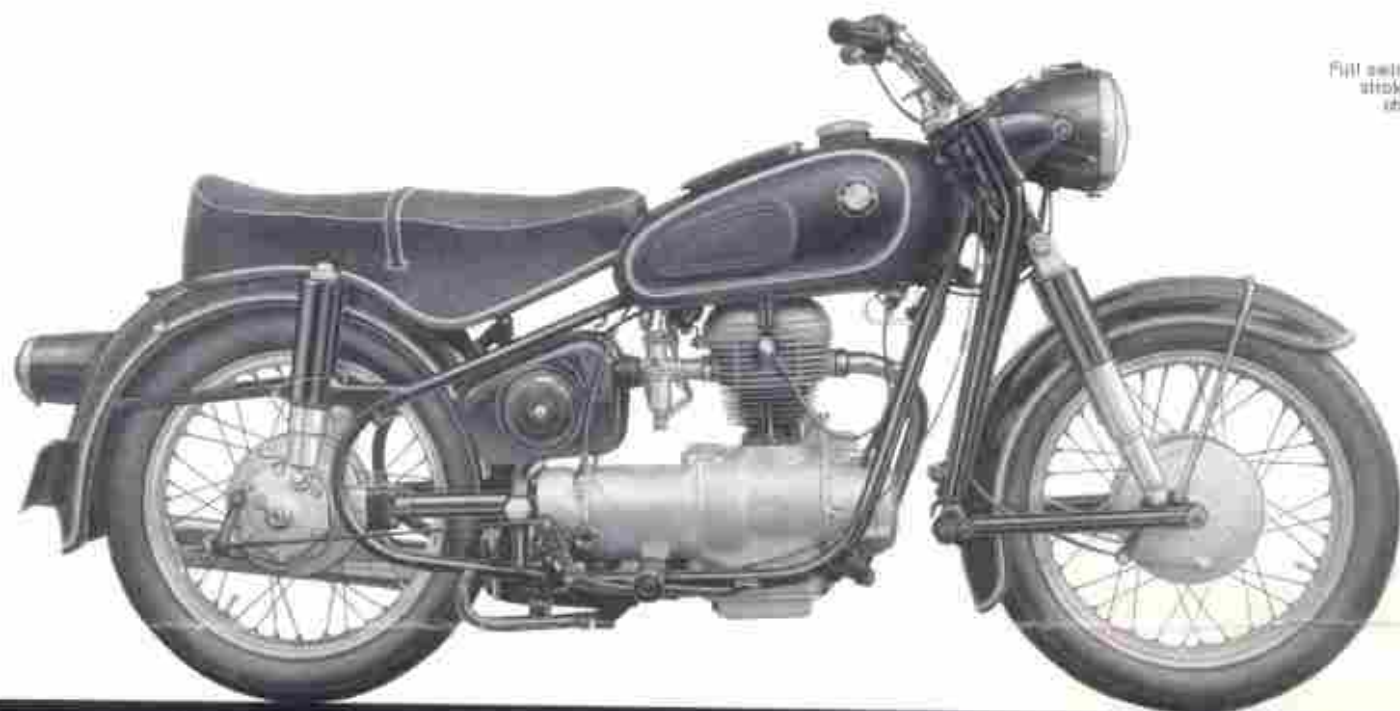
Full swing saddle stroke floating change. P- as