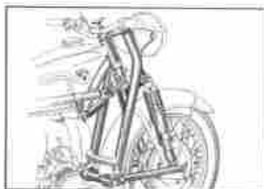
Steering damper of the BMW S-machines

BMW R 69 S equipped with bus seat (as shown), or with saddle and sports pillion. Extra-wide dual-loop hand-grips also available for all twins.