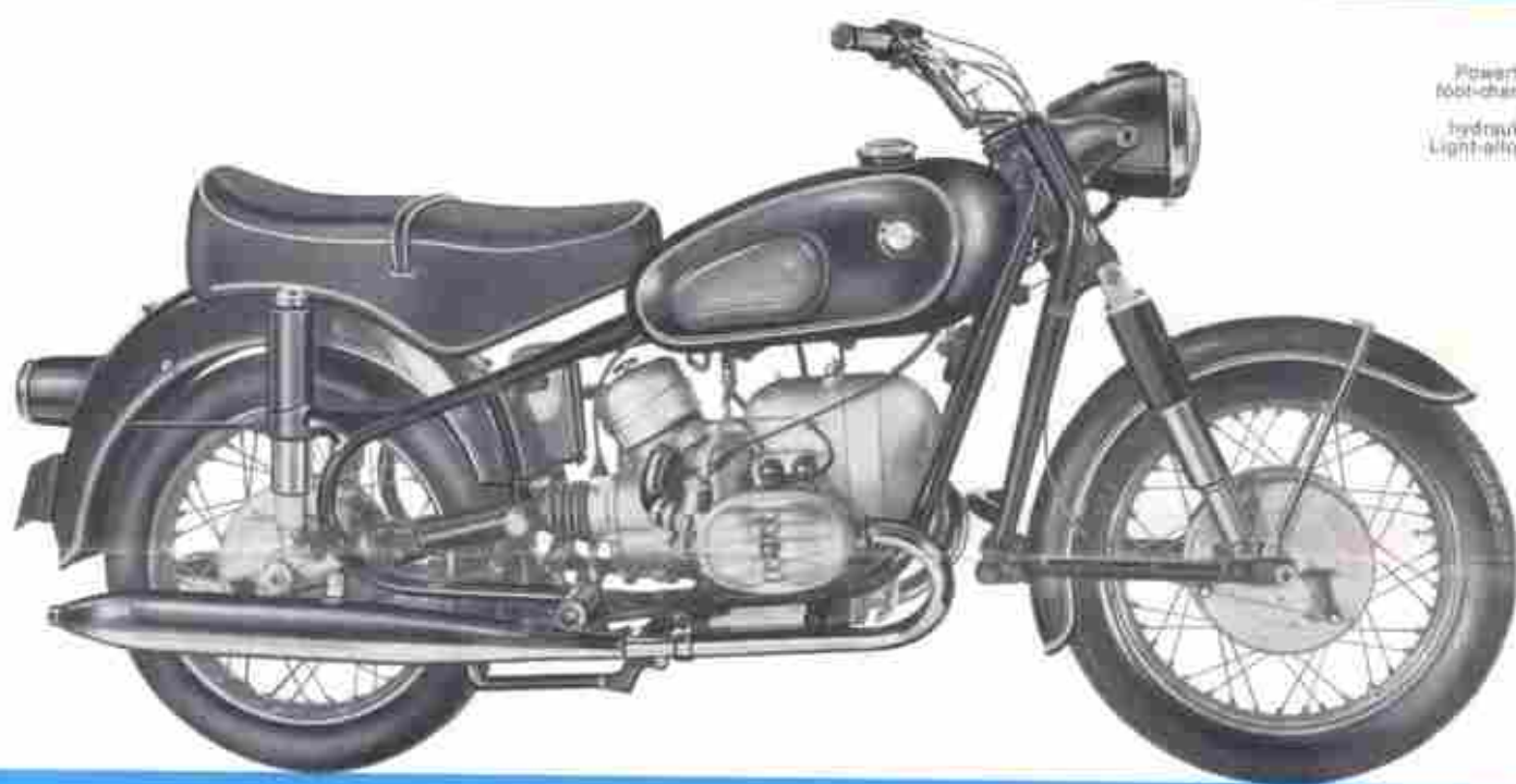
Powerful twin-cy- linder. Race- and road. hydraulic shock Lightweight full-hub