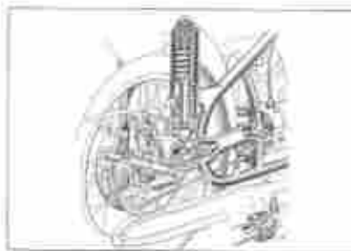
Rear wheel drive and suspension of all BMW twin cylinder machines

Available at additional charge: large Sports-Tank for Twins. Electric Turn-Signals, White color & large Sports-Tank on R-65 &