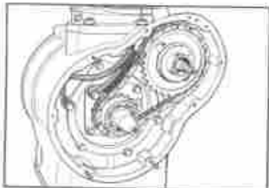
The new timing chain tightener of the R 27

Horsepower: 18 Displacement: 240 cc Bore and Stroke: 66 x 66 mm Revolutions p.m.: 7400 Compression Ratio: 5.2:1 Tank Capacity: 4 gals. Tires and Wheels: 3.25 x 18 Weight: 240 lbs. Handlebar Width: 22" Overall Length: 36" Saddle Height: 32"